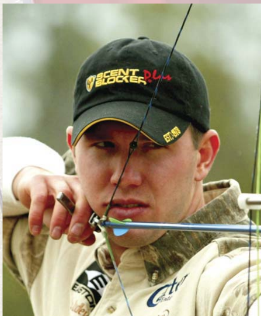
My style of almost 10 years ago

Many people mistake a hinge style release as being a "back tension" release but, more times than not, it is not being used properly. I commonly see the release just being rotated until it fires by squeezing their hand or twisting the release. Thus giving it a nickname "twist an X." These methods are not back tension as I will describe it later, but like I said there is an importance of learning the surprise shot as a stepping stone to getting the foundation laid so that we can build on it later. I do want to go on record and say that there are some fabulous shooters that do shoot a hinge