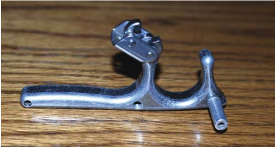
My original Colby